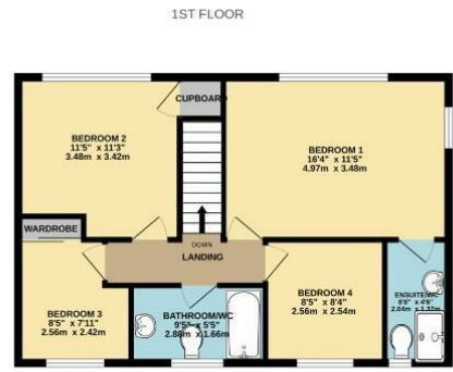
4 BED DETACHED HOUSE WITH EN-SUITE Whilst every attempt has been made to ensure the accuracy of the floorplan contained here, measurements of doors, windows, rooms and any other items are approximate and no responsibility is taken for any error, omission or mis-statement. This plan is for illustrative purposes only and should be used as such by any prospective purchaser. The services, systems and appliances shown have not been tested and no guarantee as to their operability or efficiency can be given. Made with Metropix ©2025